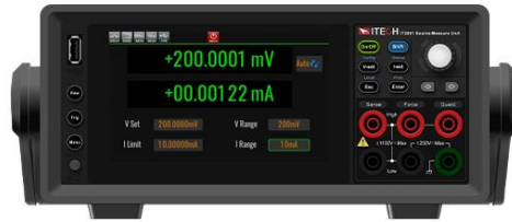
IT2800 Graphical Source Measure Unit

IT2800 SMU covers a current range from 10fA to 10A and the voltage range from 100nV to 1000V. In addition to the DC working mode, the IT2800 SMU is also capable of pulse measurement, and IT2806 has the 10A high-current pulse function. The graphical user interface and various display modes help improve test efficiency greatly for engineers. Its wide array of applications include discrete semiconductor devices, power chips, passive devices, photoelectric devices, micropower measurement, material research, and other fields.